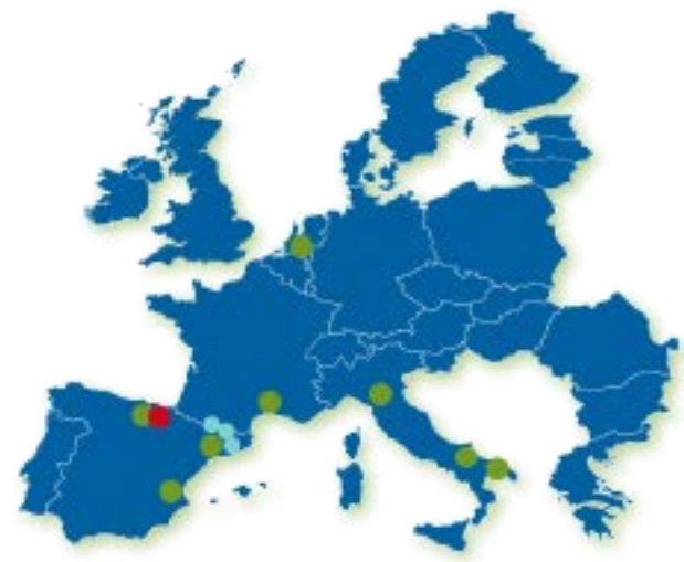
● Coordinator ● Associated Partners ● Collaborating Partners